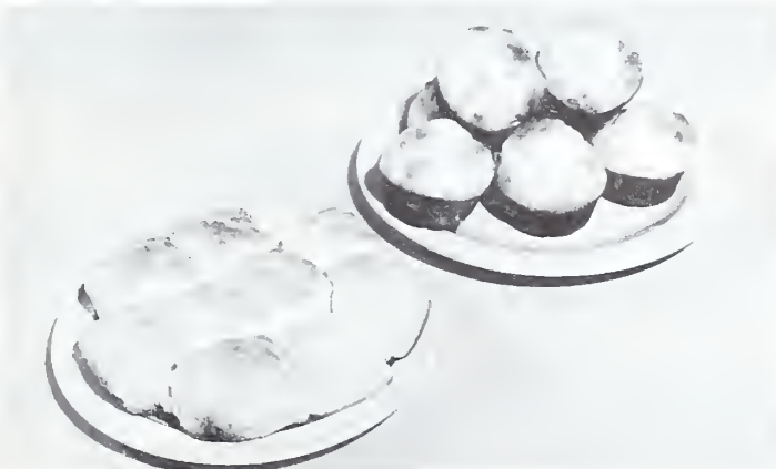
N-39873--From one basic cornmeal mix you can make piping hot biscuits or golden muffins.